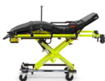
TG-1000 POWER BRAVA