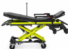
TG-1100 2 / TG-1100 4 SILVER