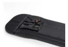
PEDIATRIC ADAPTED MATTRESS